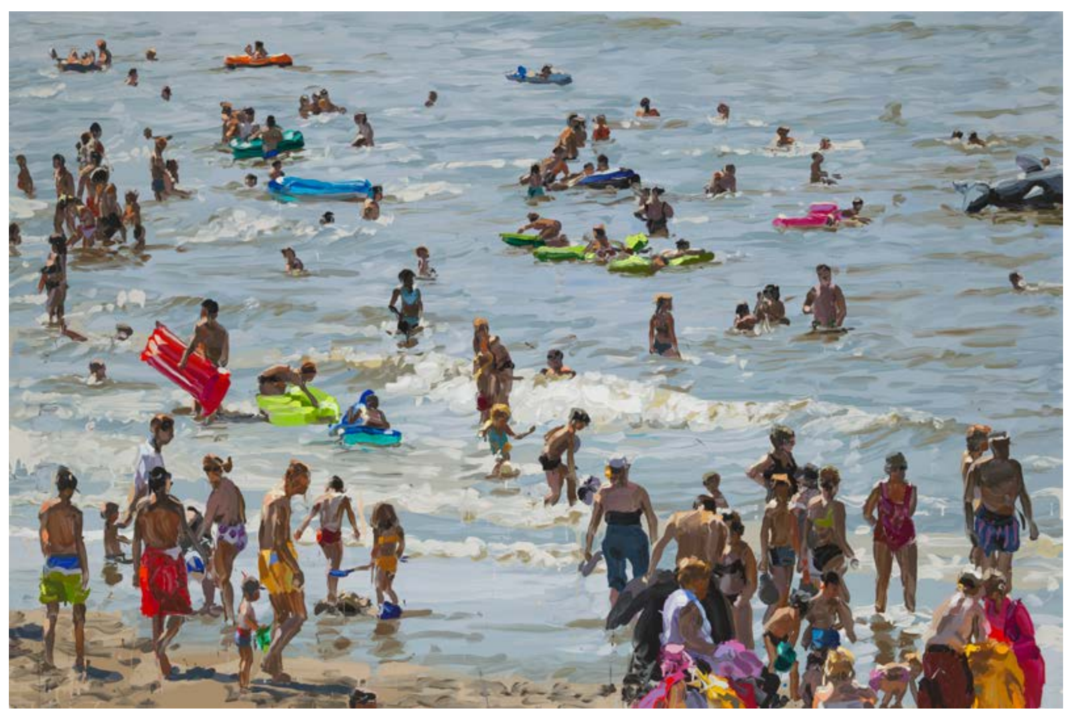
Jan De Vligher, beach, 2021, acrylic on canvas, 200 x 300 cm

There is so much colour and light in the real world that is not yet possible to generate digitally today. Also I do prefer the texture of the paint, to feel the hand of the artist and it's emotional impact. Maybe someday