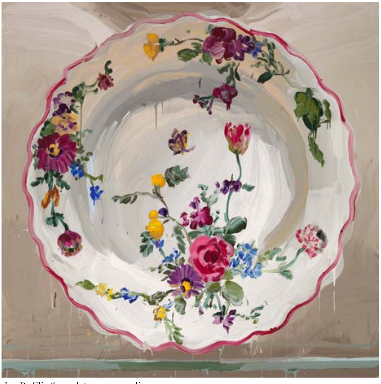
Jan De Vliegher, plate, 2015, acrylic on canvas, 240 x 240 cm Courtesy Galerie Thomas Fuchs, © PHOTOGRAPHY DOMINIQUE PROVOST - BRUGES